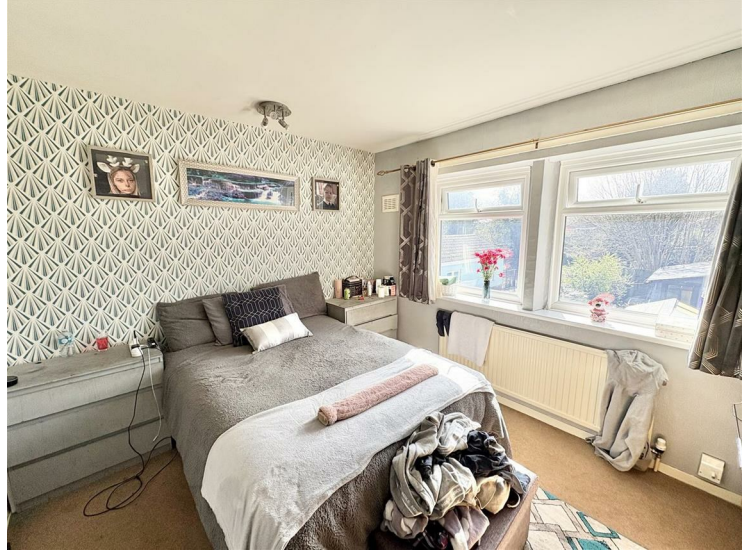
Bedroom Two 13'4" x 9'11" (4.07 x 3.03)