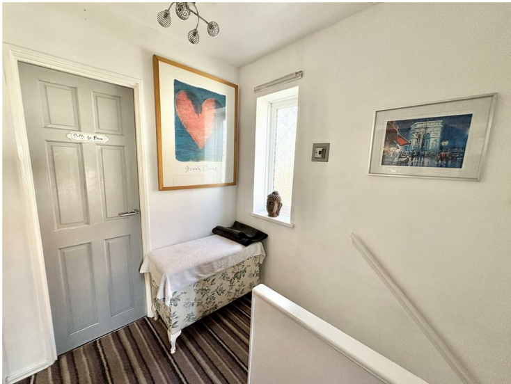
First Floor Landing 7'10" x 5'11" (2.40 x 1.81)