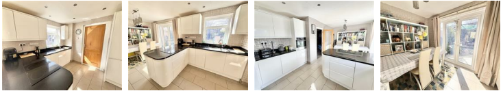
Kitchen Diner 19'5" x 11'11" (5.94 x 3.64)