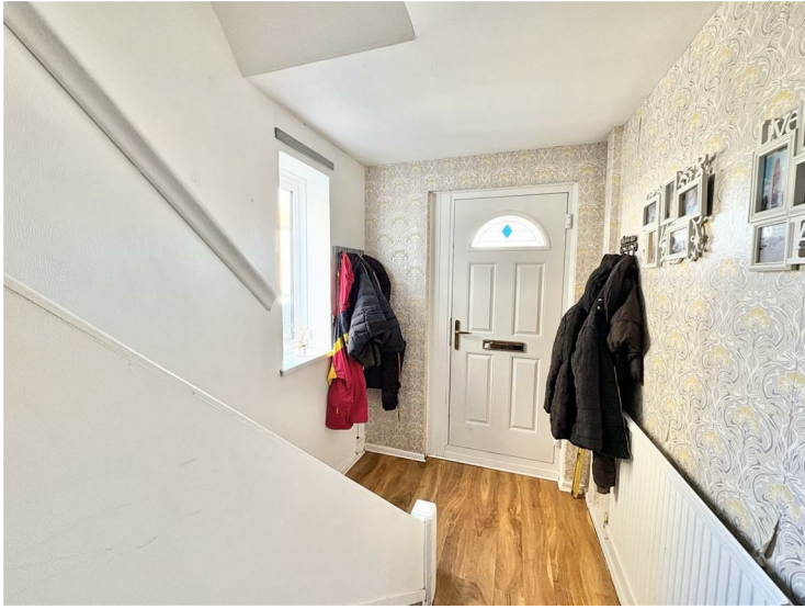
Entrance Hall 11'3" x 5'11" (3.45 x 1.81)