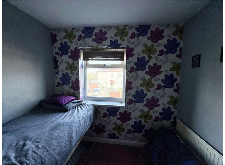
Bedroom Three 8'5" x 8'2" (2.59 x 2.49)